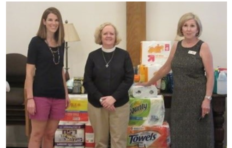
Left: St. Paul's (as did many of churches) collected donations for flood victims. Center: St. Matthew's School, Houma, adopted a school in Prairieville after the flood. Right: Trinity, Baton Rouge, had a tremendous increase in the use of their food pantry after the flood. Many of the churches (pictured are parishioners from St. Michael's, Mandeville) donated food to the pantry.