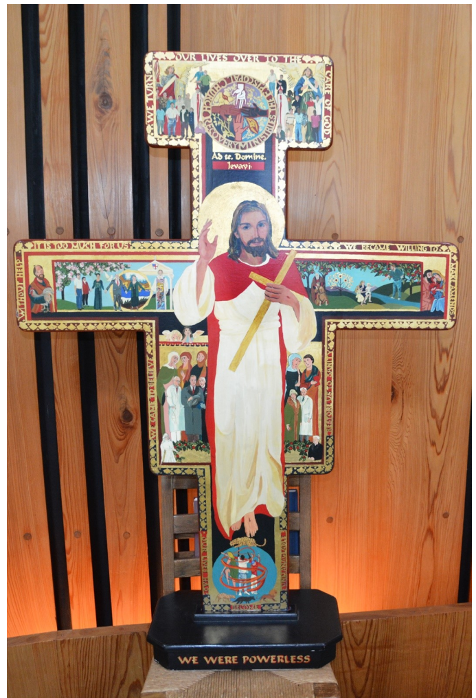
The Addiction Recovery Cross

Membership on the recovery ministry commission is not publicized whether you are in recovery or not. There are some of us, like myself, who have decided to publicly discuss our addiction and recovery, but we respect the anonymity of those in recovery who wish to serve on the commission. And make no mistake, there is still a huge stigma associated with public admission of addiction. I have many friends in recovery who are faithful Episcopalians but do not share that fact due to