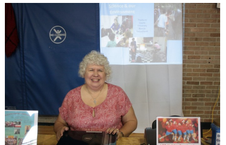
A few of the vendors and exhibitors— Left: Education for Ministry; Middle: The Stephen Ministry of St. James Episcopal Church; Anna's Place of St. Anna's Episcopal Church.