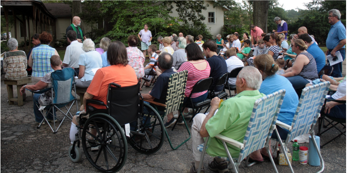
St. Francis, Denham Springs, gathered for Holy Eucharist on the Sunday after the flood in the church parking lot. The congregation is now meeting at the local United Methodist Church while their own church is being rebuilt.