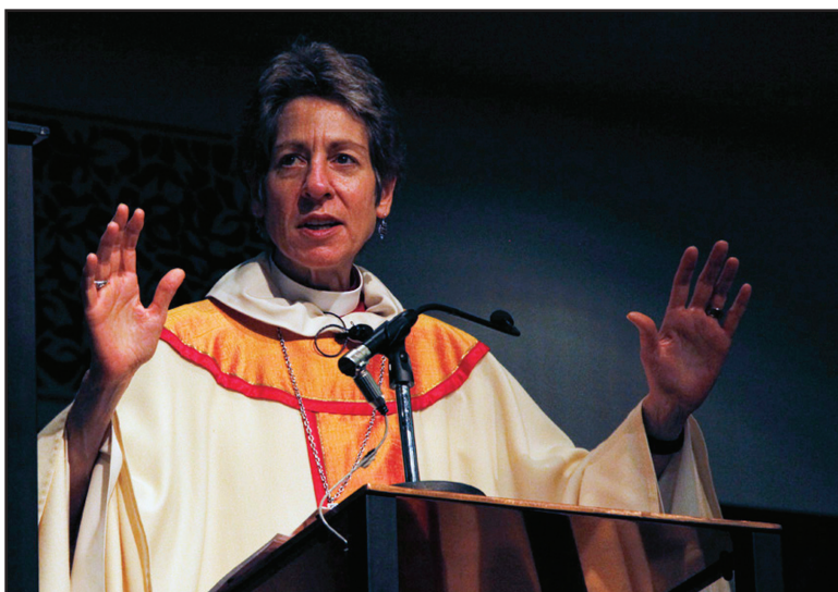
Presiding Bishop Katharine Jefferts Schori preaches at the United Thank Offering Ingathering and Festival Eucharist during General Convention.