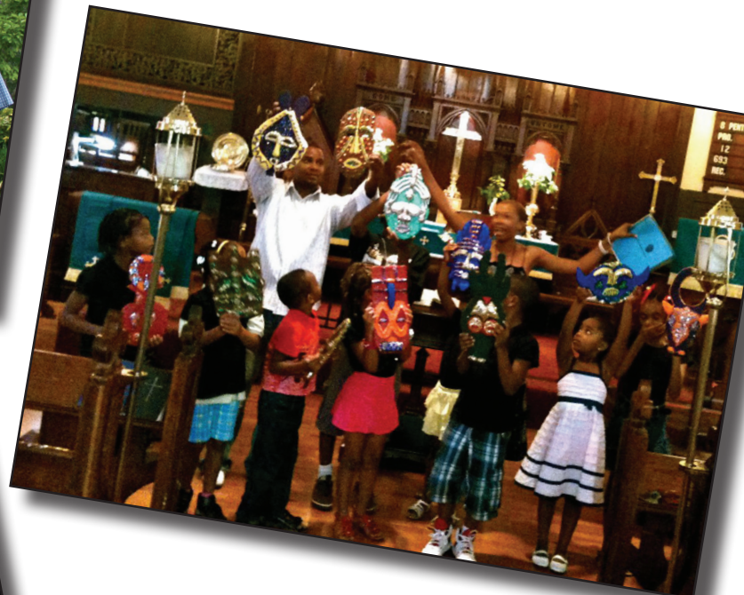
Participants of Mt. Olivet's ARTSOUL camp present masks they made this summer at the program's closing Eucharist. The kids learned to make masks, dance and drum, and also received reading enrichment.